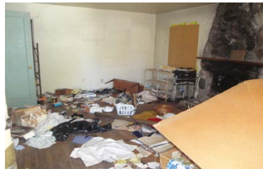
3321 Hazelwood Street

Funds recovered in 2015 through Receivership actions: $34,188.46 ($106,421.21 since 2013)