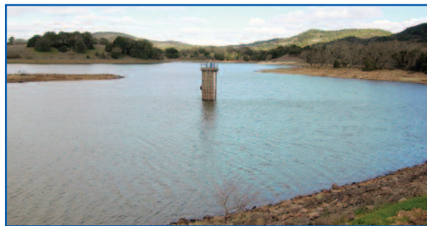
Lake Madigan Source Water for the Lakes Service Area