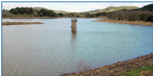
Lake Madigan Source Water for the Lakes Service Area

In order to ensure that tap water is safe to drink, the U.S. Environmental Protection Agency (USEPA) and the California Department of Public Health (Department) prescribe regulations that limit the amount of certain contaminants in water provided by public water systems. Department regulations also establish limits for contaminants in bottled water that must provide the same protection for public health.