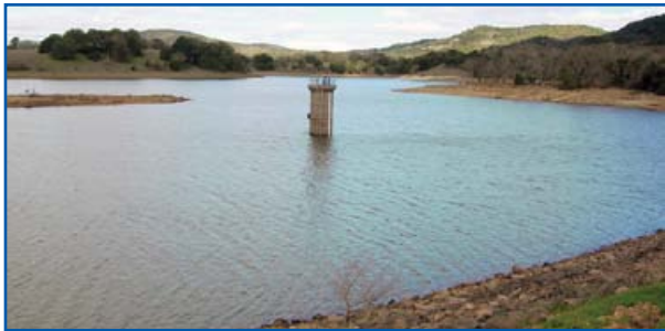
Lake Madigan Source Water for the Lakes Service Area

Drinking water, including bottled water, may reasonably be expected to contain at least small amounts of some contaminants. The presence of contaminants does not necessarily indicate that water poses a health risk. More information about contaminants and potential health effects can be obtained by calling the USEPA's Safe Drinking Water Hotline at 1-800-426-4791.